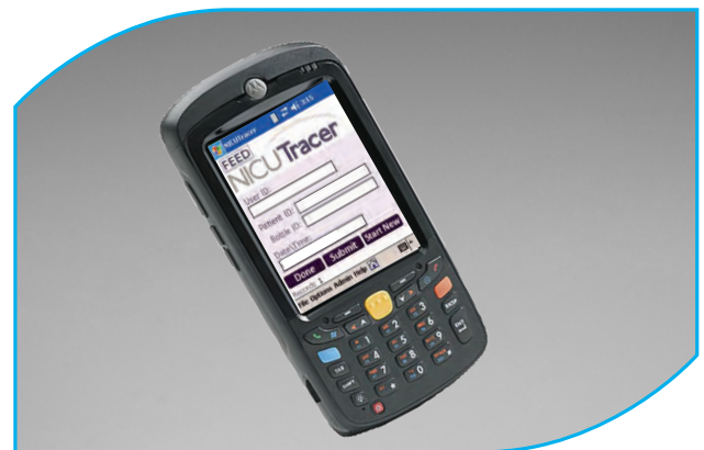
NICU Tracer Scanner