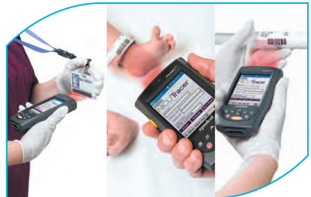
Scan your ID badge - Scan the Patient ID - Scan the feeding