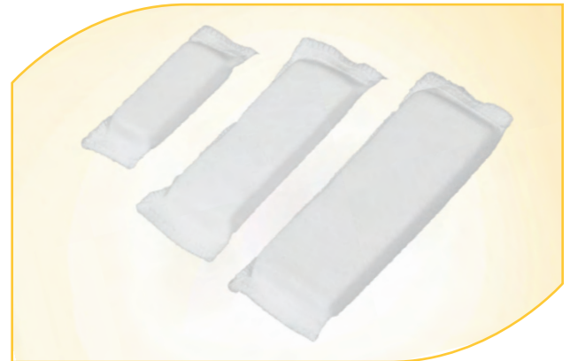
Ameritus Limb-Board – FM Series