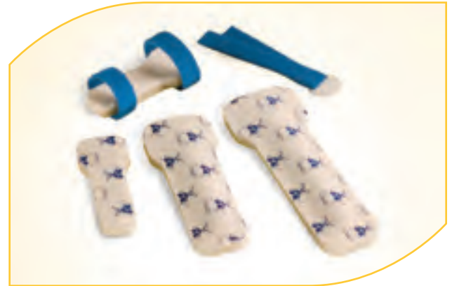
Ameritus AccuBoard - Formable AB Series Available with or without soft straps