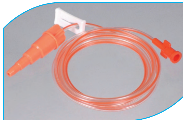
Enteral Feeding Extension Sets 36", 60" OC-ENT SERIES