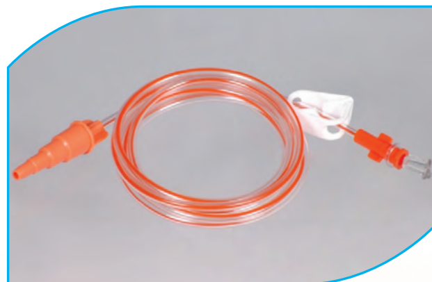
LARGE BORE Enteral Feeding Extension Set, 60" LBOC-ENT-060