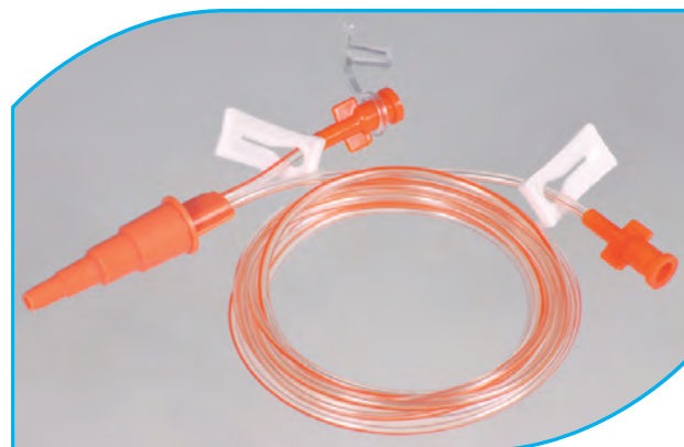
BIFURCATED Enteral Feeding Extension Set w/ Side Medication Port, 60" YOC-ENT-060