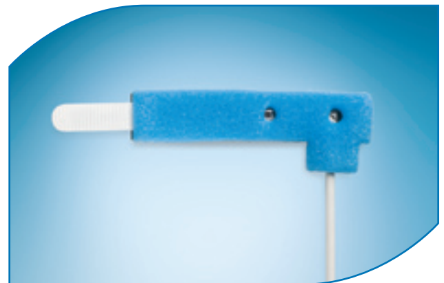
Stat-Wrap™ Sensor E542 Series