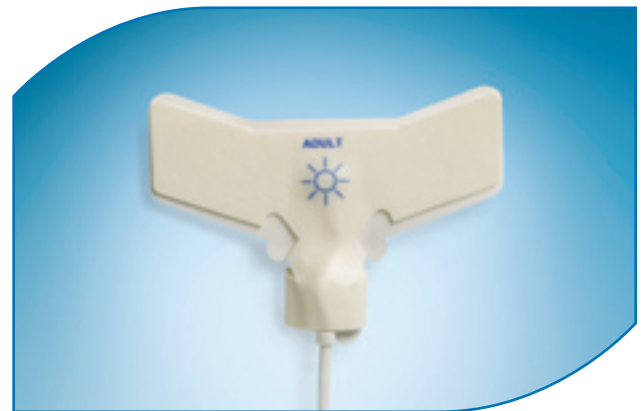
Stat-Shell® Adult Sensor E502 Series